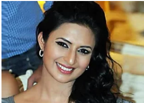
10 TV Stars Who Earn More Than Bollywood Actors CriticsUnion