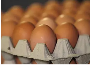
Egg prices up 25% in a month, while that of chicken declines