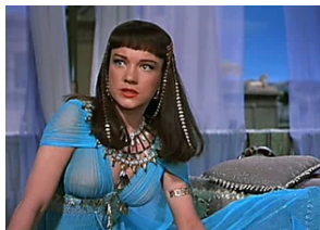
These Movie Bloopers Are Really Embarrassing OMG!