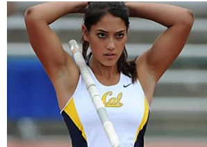
[Gallery] Athlete's Bold Confession 10 Years After The Photo OMG!