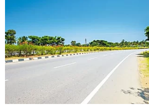
Delhi to Meerut in 45 minutes: Expressway phase-1 to be ready by next month