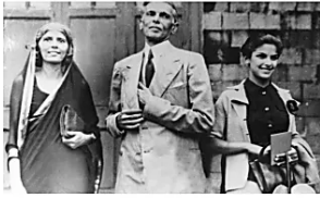
The Wadia who shunned the limelight