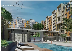
1 BHK for sale in the fun capital of India Tata Housing