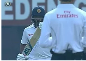
DRS 'cheatgate' controversy erupts in Kolkata test over Perera's call