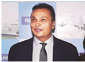
All 7 Anil Ambani group stocks hammered as Rcom fails on interest payment