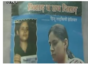
Muslim men are terrorists, they trap Hindu women: Lessons from Jaipur fair