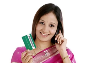
Don't miss these - Credit Card Offers. Apply! BankBazaar.com