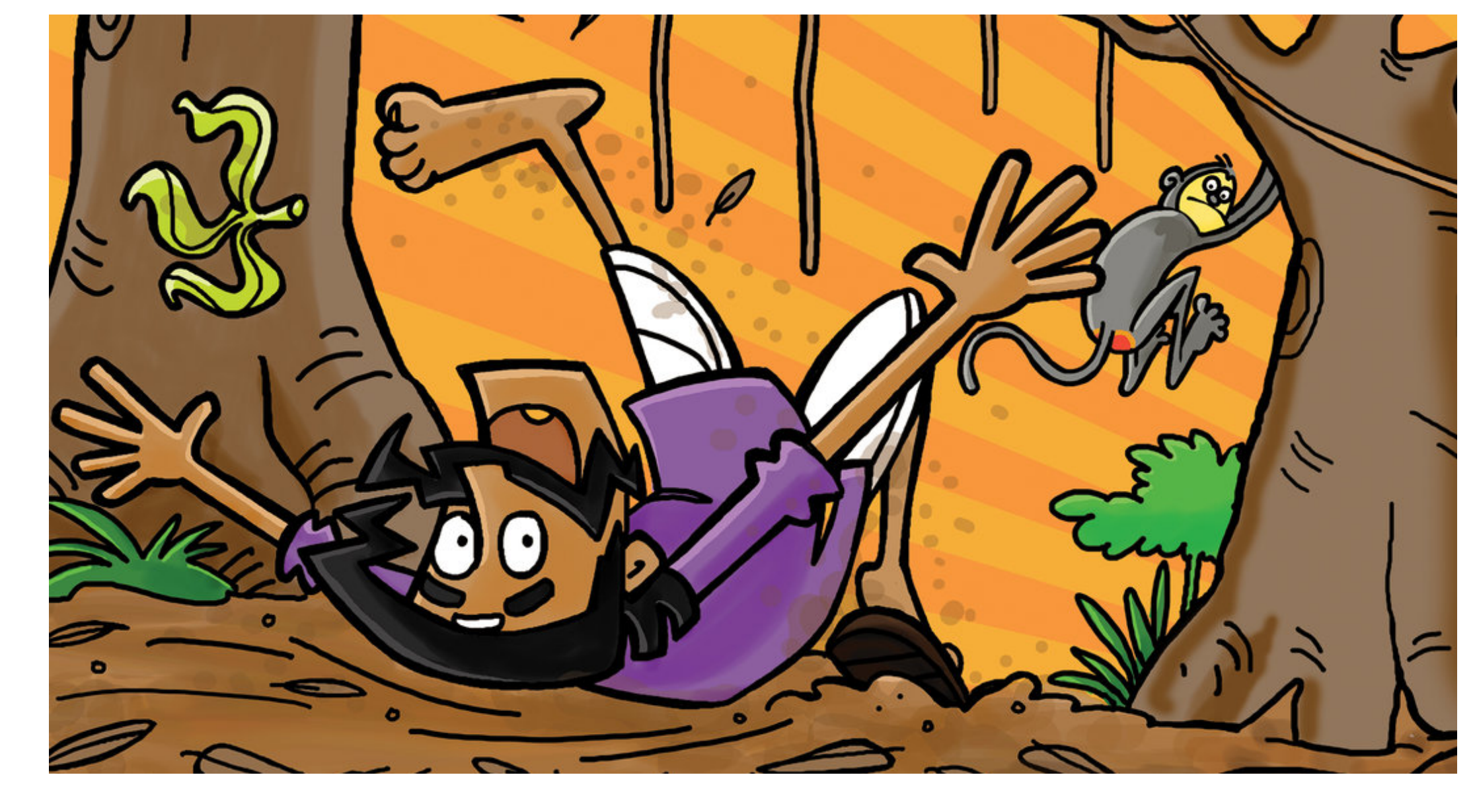
On the way, he slipped on a banana peel. Swoosh, he went down, and his chappals got stuck in the mud.