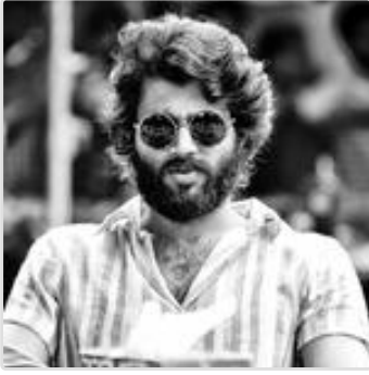
Watch Arjun Reddy, a Telugu comedy drama film Prime Video