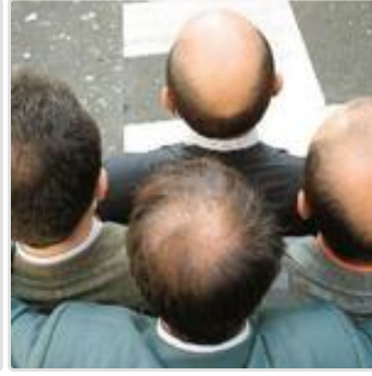
Easy baldness treatment for men to regrow hair naturally NutraLyfe Regain