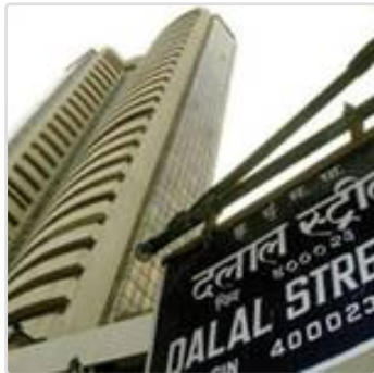
Sensex up 117 pts; Nifty ends a tad below 10,200 Times of India