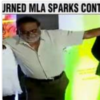
Karnataka MLA caught dancing in party, faces flak Times of India