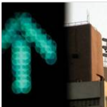
Market close: Nifty, Sensex end with moderate gains Times of India