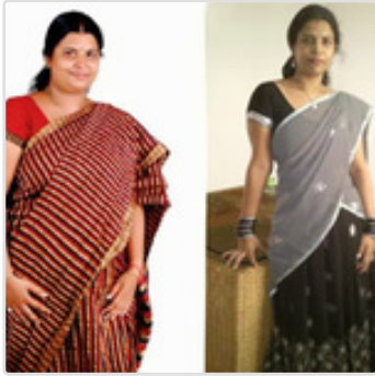
नेचुरल तरीके से मोटा पेट घटाए 1 गज़ब नुस्खा (तुरत अपनाएं) Fit Mom Daily