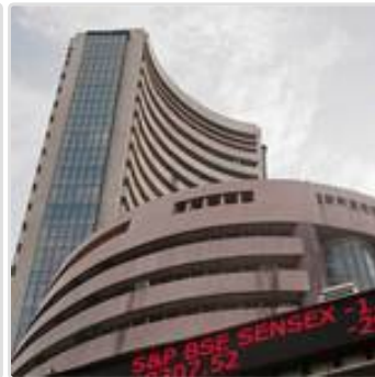
Market close: Nifty, Sensex end Samvat 2073 on a tepid note Times of India