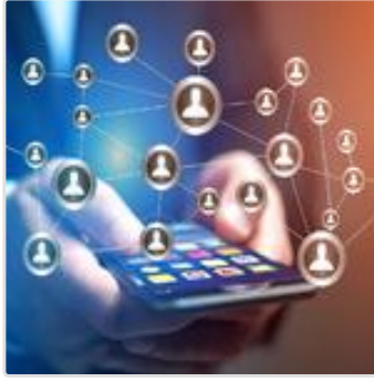
Looking for highly engaged audiences? Times Group