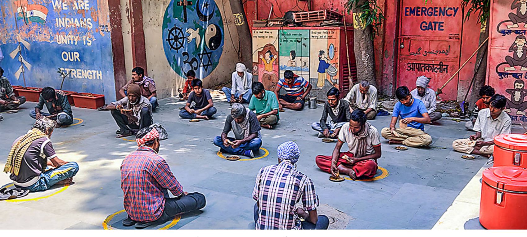
COVID-19 Doesn't Scare Them as Much as Starving The Akshaya Patra Foundation | Sponsored

Post Comment(s) * The moderation of comments is automated and not cleared manually by indianexpress.com.