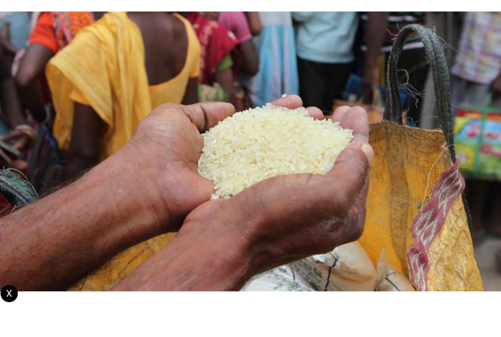
Ninety four per cent of eligible families had received extra PDS rations by end May and 80 per cent had received cash entitlements averaging close to Rs 2,000.

Written by Gaurav Gupta, Roopa Kudva | Updated: July 13, 2020 9:29:54 am